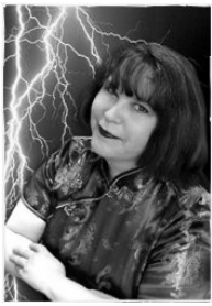
Rachel Caine Author Guest

Rachel Caine is the New York Times and internationally bestselling author of the young adult Morganville Vampires series (Glass Houses, The Dead Girls' Dance, Midnight Alley, Feast of Fools, Lord of Misrule, Carpe Corpus, Fade Out, Kiss of Death, Ghost Town, Bite Club, and Last Breath). She is also the author of the powerhouse urban fantasy Weather Warden series (Ill Wind, Heat Stroke, Chill Factor, Windfall, Firestorm, Thin Air, Gale Force, Cape Storm, and Total Eclipse), as well as the bestselling Outcast Season series, set in the universe of the Weather Warden novels (Undone, Unknown, and Unseen).